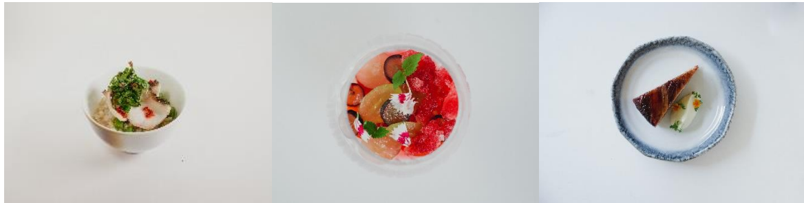
Photo Caption (L-R): Post Main – Wild Fish Congee, Java Ginseng & Coriander tossed with Preserved Plum Dressing. Pre-Dessert – Roselle Granita with Cherry Pit Brandy, Seasonal Fruits & Lemon Balm. Dessert – Brown Butter Banana Cake, Homemade Crème Fraiche, Marigold & Mexican Tarragon.