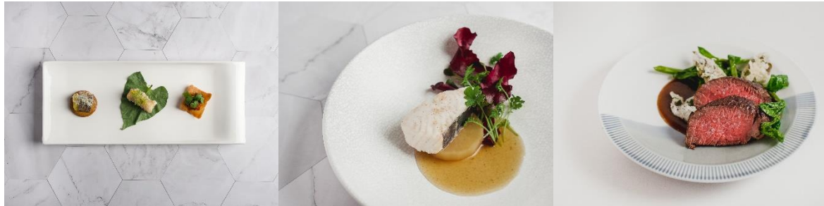
Photo Caption (L-R): Snacks – Brown Butter Mushroom Pate on Almond Crisp, Citrus Seabass Belly & Peppery Rami Nettle, Smoked Tomato Chutney on Thyme-Manchego Tuile. Appetiser – Local Trevally, Daikon, Grilled Cabbage Broth. Main – Chipotle-Berry Glazed Wagyu Chuck Tender, Vegetable Jus & Spiced Malabar Spinach